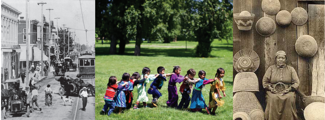
Looking forward: the potential development of Albany as a synthesis of identities and practices